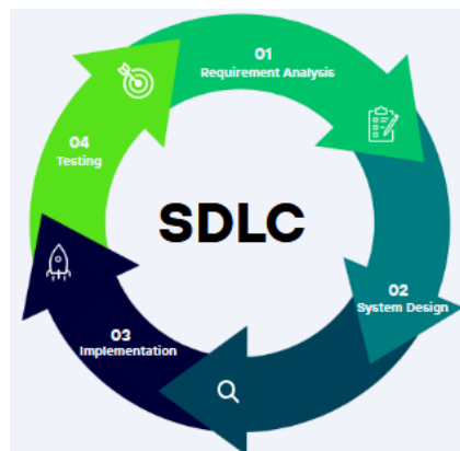
Fig.1. System Development with SDLC

The system development process is conducted using the SDLC method, which consists of the following stages :